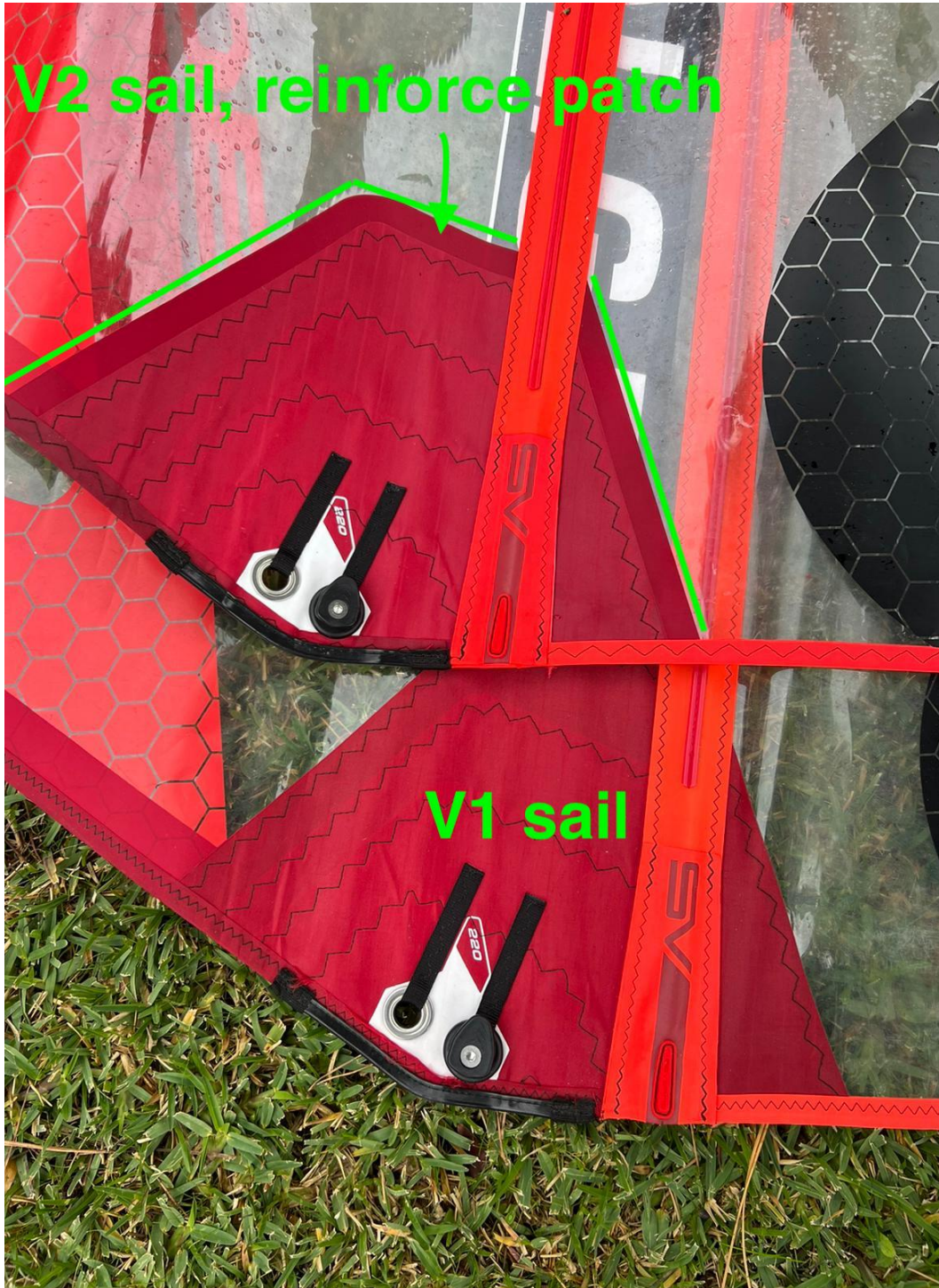
Reinforce patch at clew, comparison V1 and V2