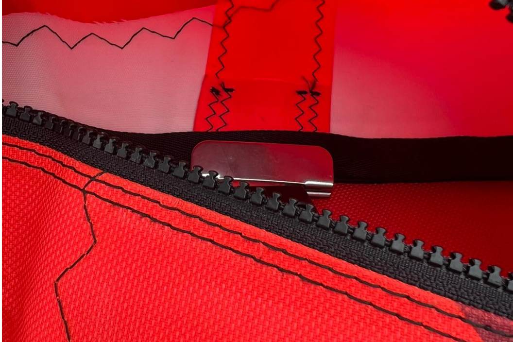
Body original patch V1 sail