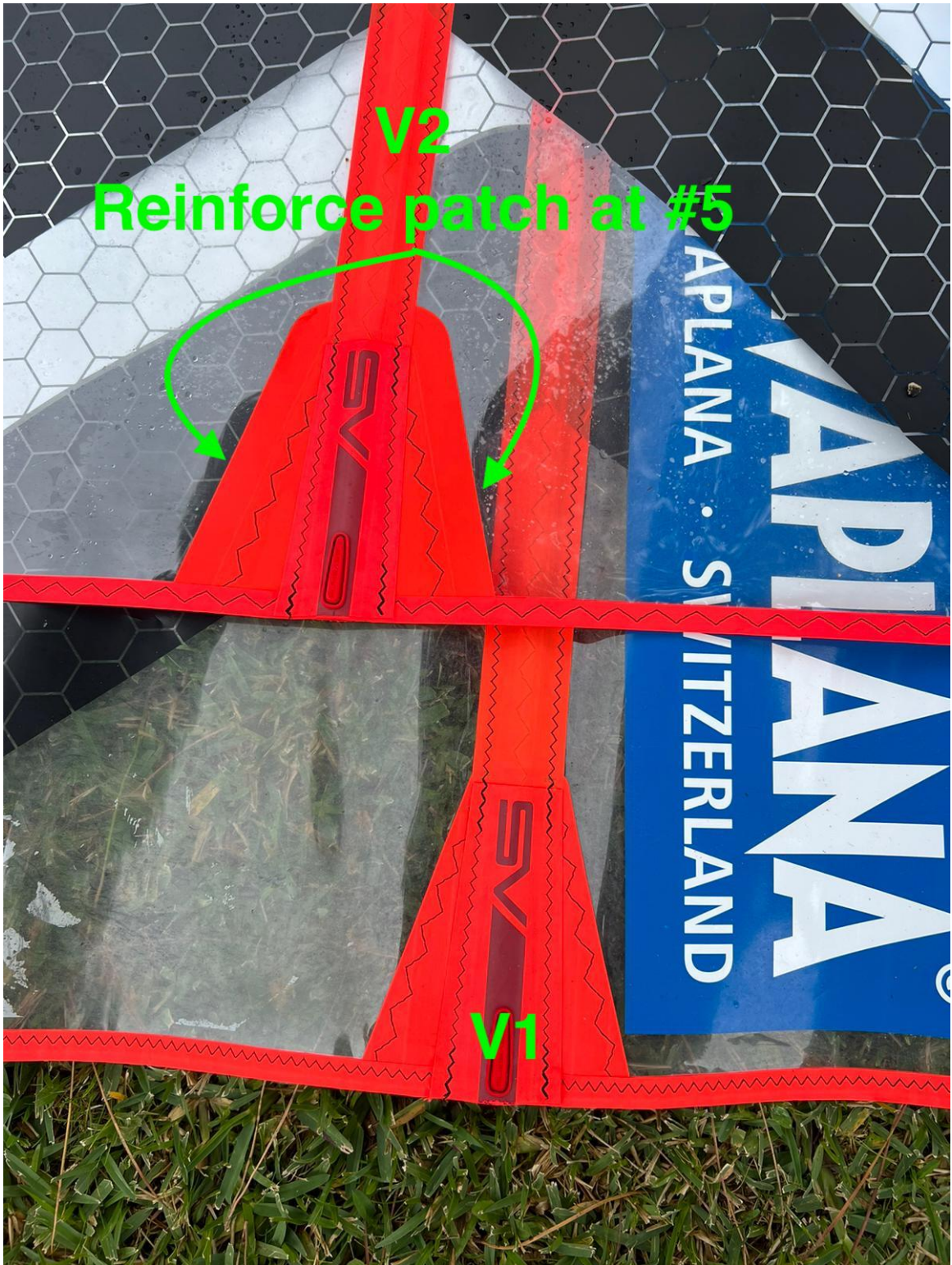
Batten #5 leech reinforcement comparison V1 and V2