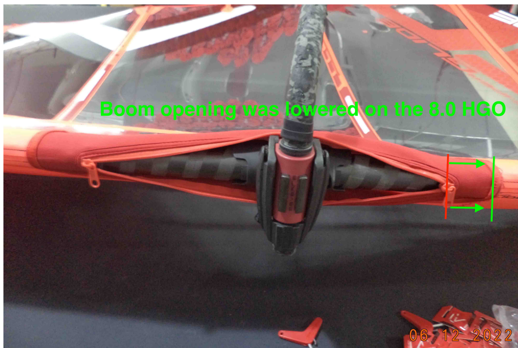
Bottom boom limit was lowered