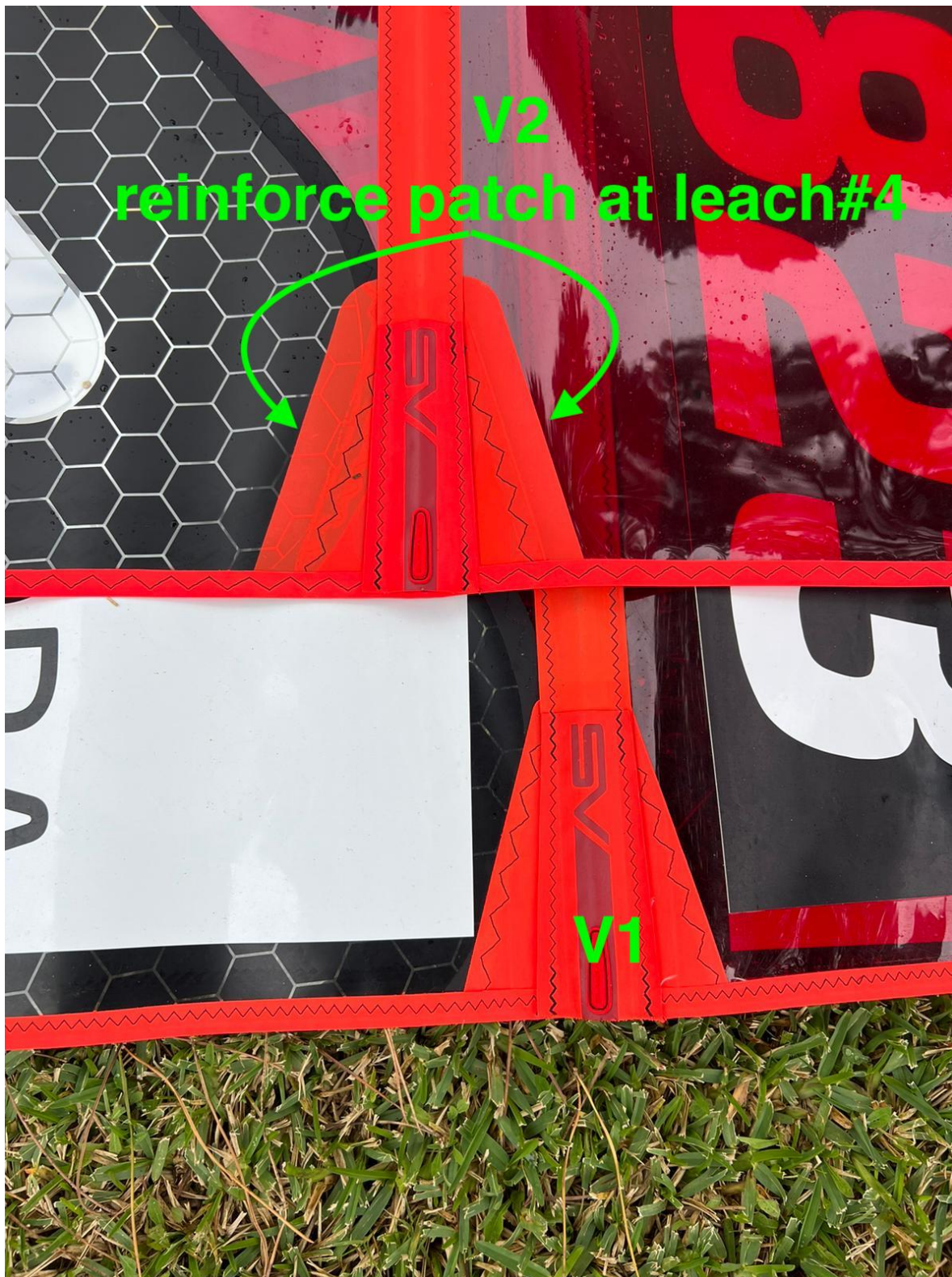
Batten #4 leech reinforcement comparison V1 and V2