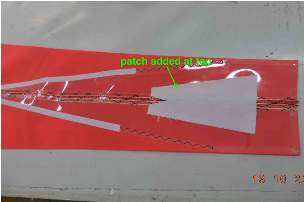
Patch added at top