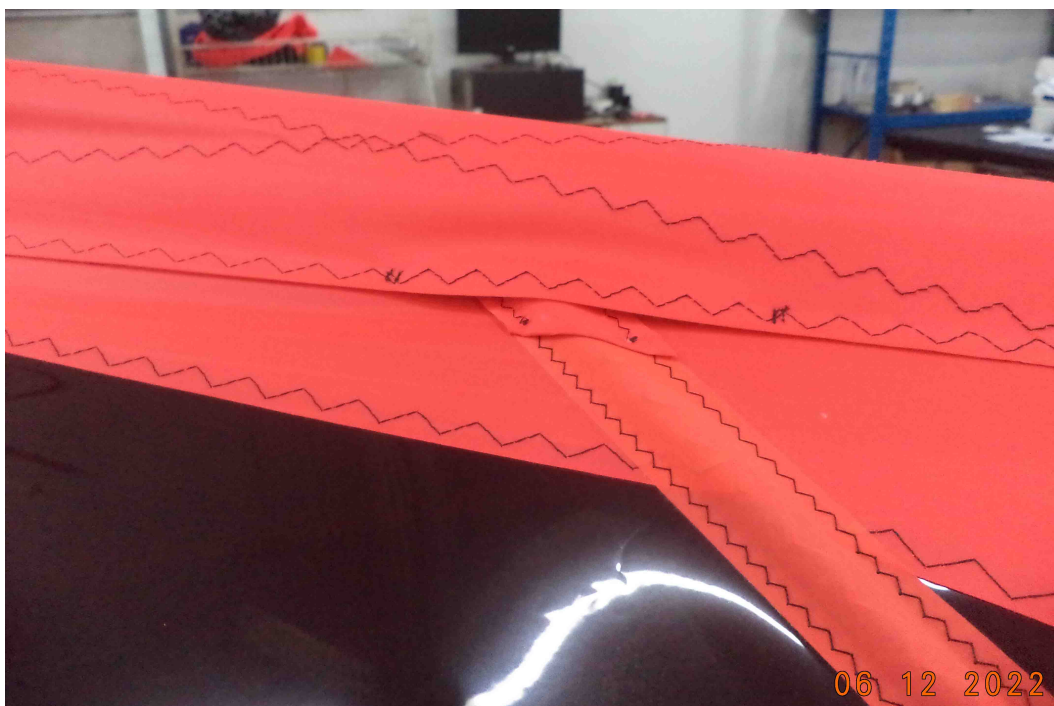
Every batten has a drainage opening, scroll right